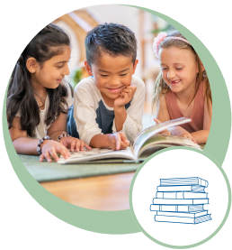
Literacy Intervention in Elementary School