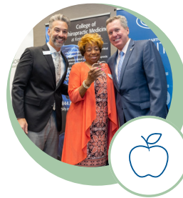
Teacher Externships & Retention Incentives