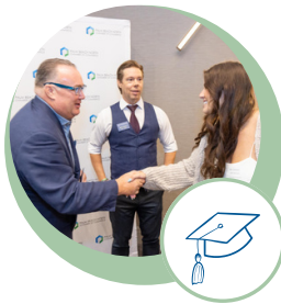
Leadership Awards for Post-Secondary Education